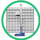
Tote & Case Robotics